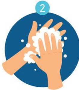
2 PALM TO PALM