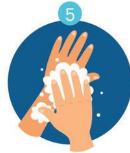
5 BACK OF HANDS