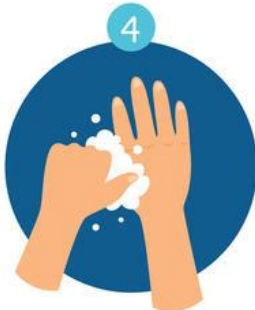
4 FOCUS ON THUMBS