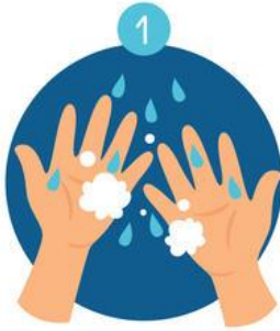
1 WATER AND SOAP