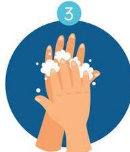
3 BETWEEN FINGERS