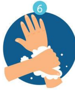
6 FOCUS ON WHISTS